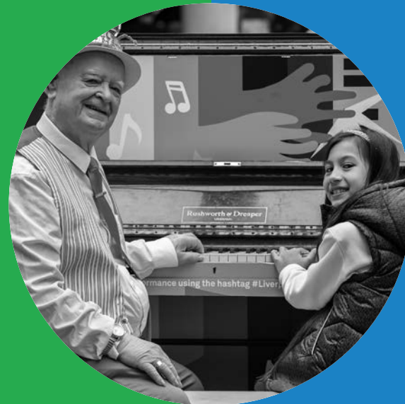
Tickle the Ivories Pianos July - September