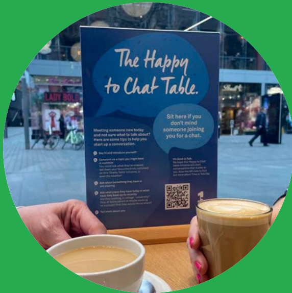
Happy to Chat Tables 03 February