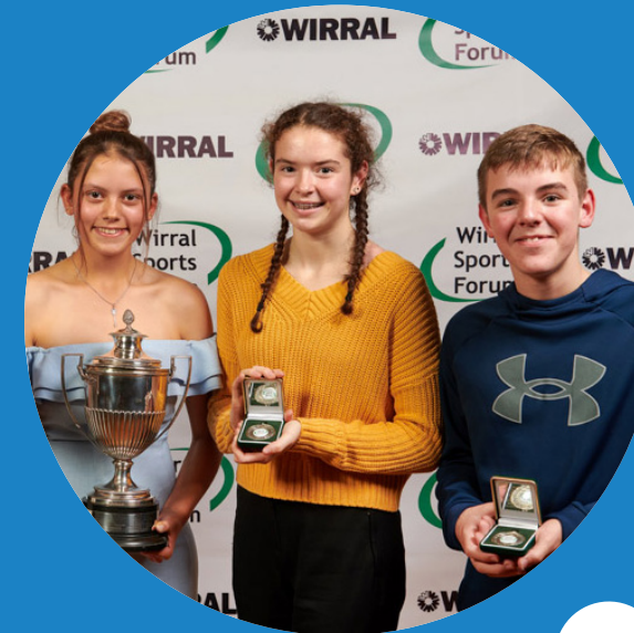
Wirral Sports Awards 13 October