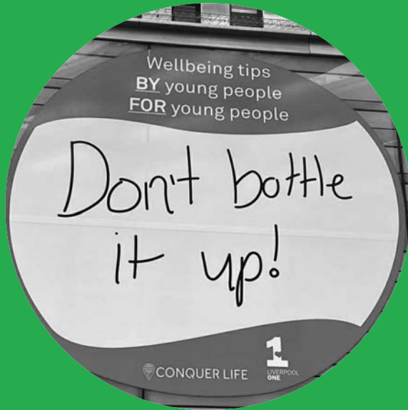
Mental Health Speech Bubbles 07 February