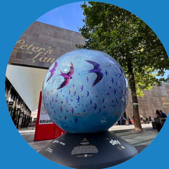
The World Reimagined August - October