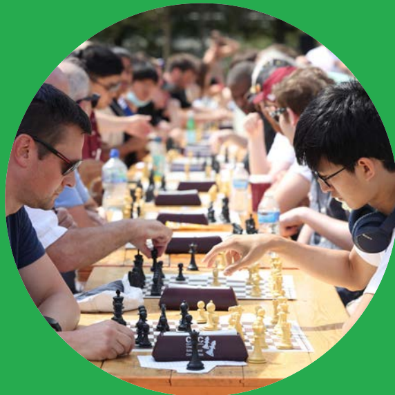
ChessFest 17 July