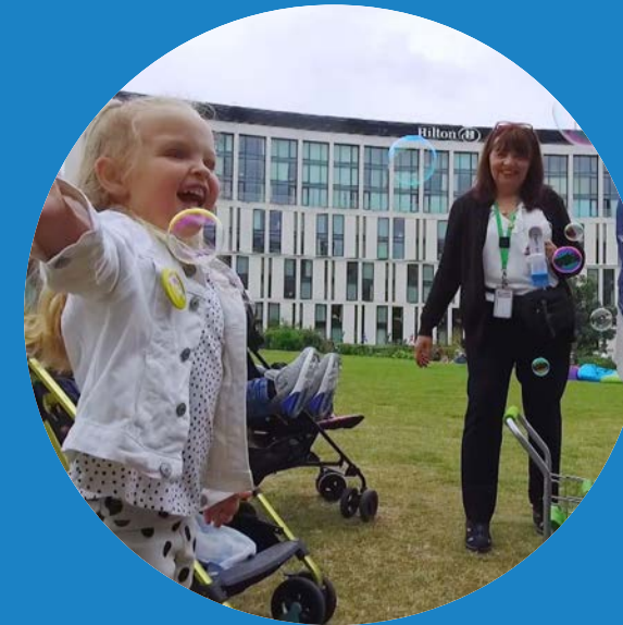
First Five Festival 18 June