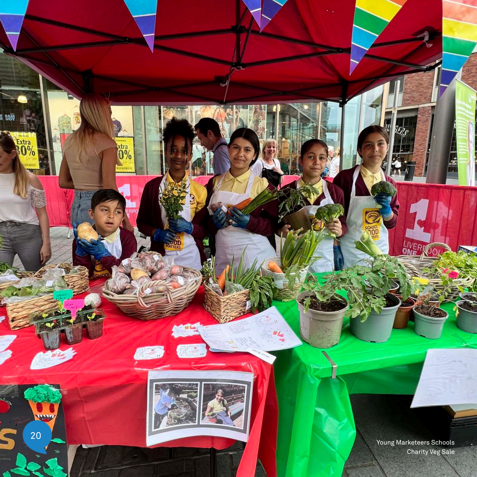
Young Marketeers Schools Charity Veg Sale