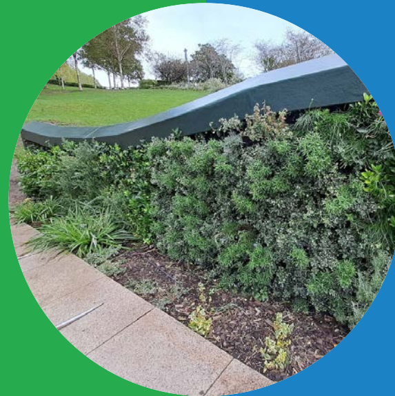
Green Wall Chavasse Park 18 March