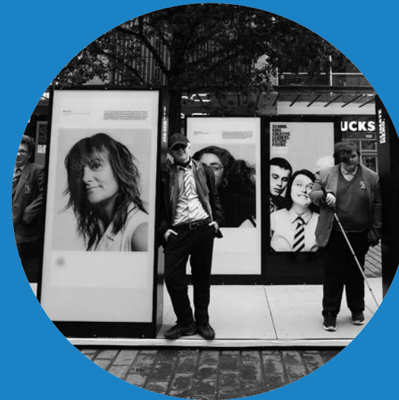
Everyday Climate Heroes 26 May